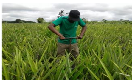
Photo 2 : Prélèvement d'échantillon de sols sous culture d'ananas à Zè Prise de vue : GBAI N.I., septembre 2019