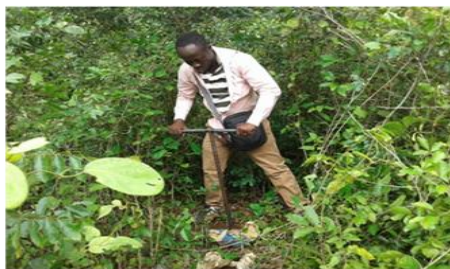
Photo 3 : Prélèvement d'échantillon de sol sous jachère sans culture d'ananas à Tori-Bossito Prise de vue : KOOKE G.X., septembre 2019