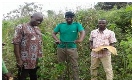
Photo 4 : Prélèvement d'échantillon de sols sous jachère sans culture d'ananas à Zè Prise de vue : DJOSSOU J. M., septembre 2019