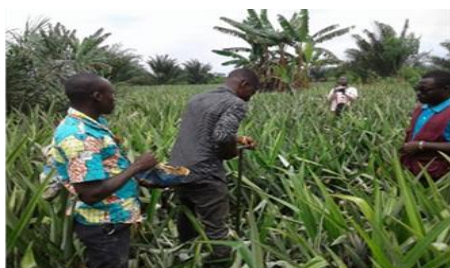
Photo 1 : Prélèvement d'échantillon de sols sous culture d'ananas à Tori-Bossito

The 0-20 cm depth balance samples were taken on dates 10, 11 and 22 September 2019 in the municipalities of Allada, Tori-Bossito and Zè on the Plateau d'Allada. In each municipality considered on the Plateau d'Allada, three plots (conventional pineapple field, organic pineapple field and fallow without pineapple cultivation). Each plot was cut into three lots of the same area. In each batch obtained, three soil samples 0-20 cm deep were taken along the diagonal. In order to obtain representative composite samples, the carrots obtained at the layer are mixed homogeneously. A 100 g sample of this mixture was taken from a polyethylene bag. For each plot considered, three soil samples were taken. A total of 27 soil samples were taken from all three municipalities. These samples were conveyed to the laboratory, dried at room temperature and then sieved to 2 mm in order to remove coarse elements. Plate 1 below illustrates the process of taking soil samples under pineapple cultivation and under fallow without cultivation pineapple