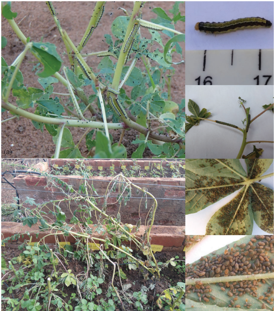
Figure 3 Pests associated with Gynandropsis gynandra . (a) Helicoverpa armigera . (b) Brevicoryne brassicae .

Pests found in G. gynandra included stem borers, leaf miners, webbers, and defoliators (caterpillars, beetles) (Sithanantham et al., 2004). About 17% yield loss due to insects was estimated on a station in Kenya by Sithanantham et al. (2004). Cotton bollworm ( Helicoverpa armigera Hübner) and greenflies attacked leaves of the species (Figure 3a). Cabbage aphid ( Brevicoryne brassicae L.) is one of the serious pests, causing stunted growth