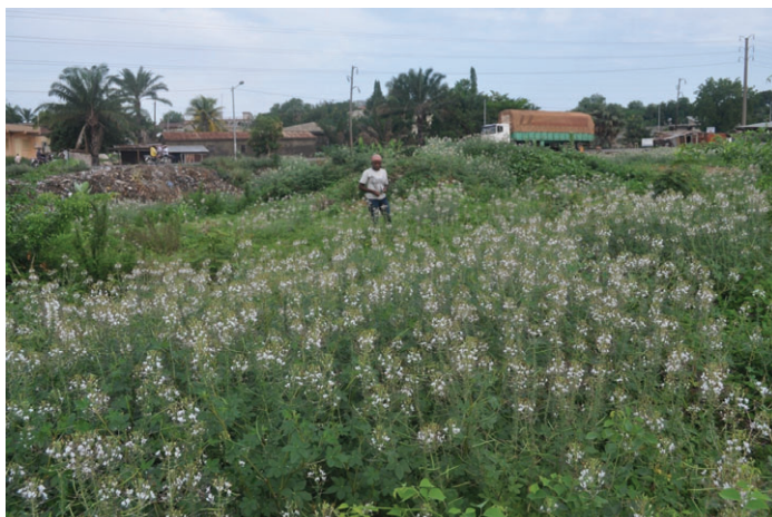
Figure 2 Invasive spider plants in a waste area along road side in Kara (northern Togo).

understand seed behaviour and improve seed quality are available for most African Leafy vegetable including spider plant.