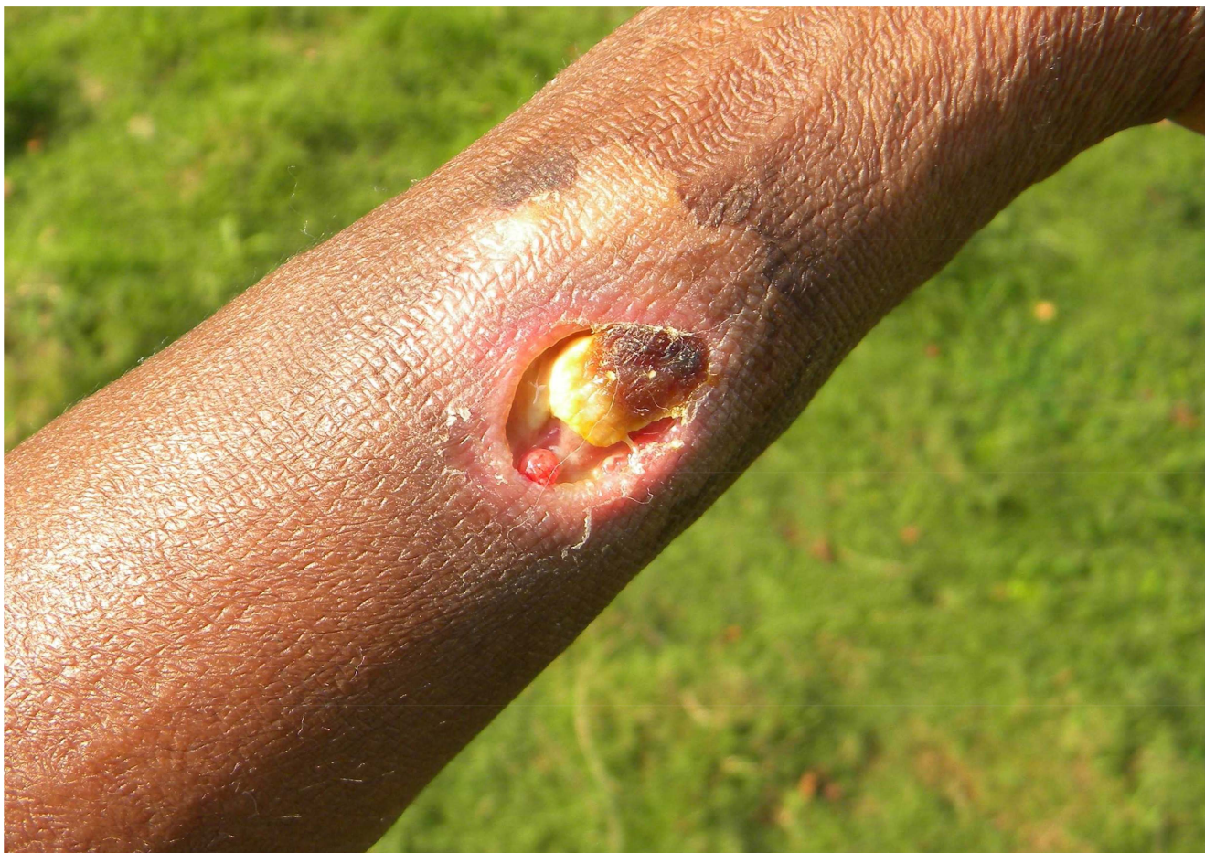
Figure 2. Early lesion of Buruli ulcer. doi:10.1371/journal.pntd.0003200.g002