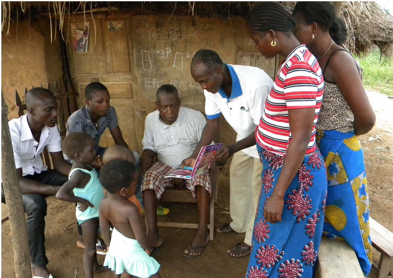
Figure 3. Community health volunteer in action. doi:10.1371/journal.pntd.0003200.g003

Apart from the community health volunteers, teachers, family members, and former patients also proved to be crucial in the referral system. The methods used by the community health volunteers for case detection are active case finding and education. (Figure 3). In data compiled from all centers, community health volunteers were more successful in getting patients to the health center in an early stage of disease than other referral sources. However, when health center specific data was analyzed, this effect could not be seen anymore. This suggests that the quality and/or training of community health volunteers are not uniform throughout the area. Barriers in the early presentation by community health volunteers (e.g. logistics) could also be different throughout the area.