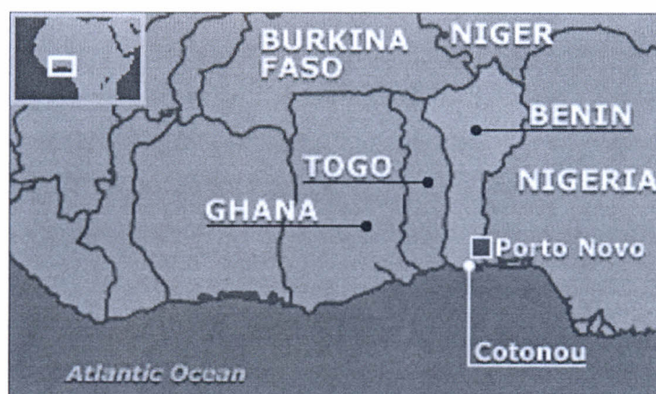
Fig. 1. Map of Benin

Located on the West coast of Africa, the Republic of Benin is small (114,763 square kilometers), with a coastline on the Gulf of Guinea nestled between Nigeria, Niger, Burkina Faso, and Togo (Figure 1). The population, estimated at 7,839,914 in 2006, includes a multitude of ethnic and linguistic groups. Benin remains one of the world's least developed countries and has been ranked 163 of 177 on the United Nations Human Development Index (2005). Demographic and health indicators are given below (Table 1).