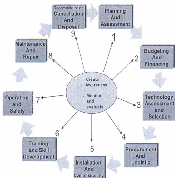
Fig. 3. The Healthcare Technology Management Cycle

The Healthcare Technology Management Cycle 11 : An example of a framework for health equipment management in developing country.